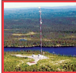
■ Telecommunications site.