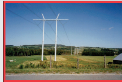
■ 735 kV transmission line-tubular portal structure.