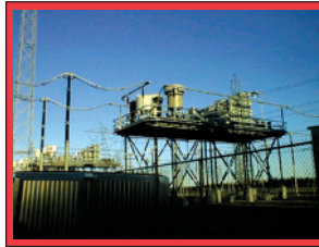
■ 735 kV series capacitor platform.