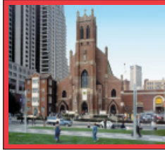
■ St. Patrick's Catholic Church , San Francisco.

Degenkolb's involvement with MCEER allows the firm to maintain contact with the earthquake community at large. MCEER has a multidisciplinary approach and has a specialty focus in healthcare.