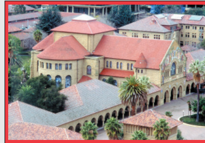
■ Stanford Memorial Church , Stanford, California.

seismic evaluation and analysis, seismic strengthening, seismic hazard reduction programs, nonstructural anchorage/bracing, seismic risk assessment, PMLs, and ST-RISK™ Software for earthquake risk analysis of structures.