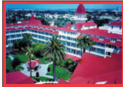
■ Hotel Del Coronado , San Diego, California.