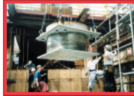
■ High City Kiyosumi , Tokyo, Japan.

To facilitate cooperative interaction with other leaders in the seismic mitigation community.