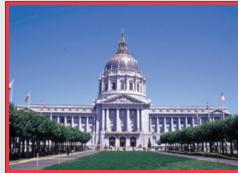
■ San Francisco City Hall , San Francisco, CA.

bearings, lead rubber bearings, teflon sliders, wall dampers and other energy dissipation devices, DIS is well positioned to meet the needs of the project engineer.