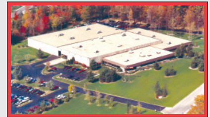
■ E-Structures Dynamic Hydraulic Test Bench for Seismic Dampers and facilities in Orchard Park, New York and Irvine, California .