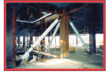
■ Installations of E-Structures Seismic Dampers in the 3 COM Building , on the Coronado Bridge , and Vancouver Reservoir .