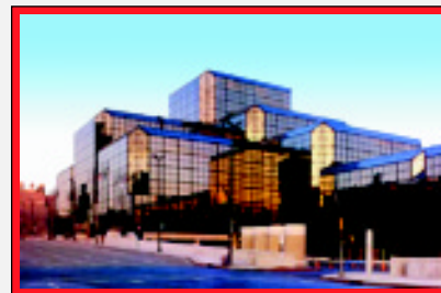
■ NYC conference center (Javitz Center).

products to market quickly at least cost. Innovative engineering to help clients achieve elegance with economy remains the fixed aim of the firm's business.