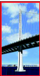
■ The Bay Bridge project.