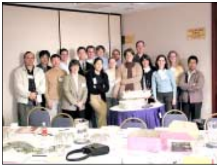
■ Attendees at the Tri-Lateral SLC meeting pose for a group picture.

The tragic events of September 11 affected, besides many major things, the activities of MCEER's Student Leadership Council (SLC). A few SLC members were preparing to attend the Student Retreat as part of the Engineering Research Centers (ERC) Annual Meeting organized by the National Science Foundation (NSF). This meeting was scheduled to take place in Washington D.C. this past November, however it was canceled as a safety precaution.