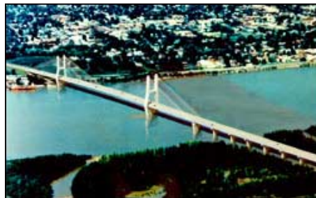
■ Computer rendering of the cable-stayed Bill E. Emerson Memorial Bridge.

Currently, two alternative strategies for the instrumentation system are under consideration. The first option involves a conventional scheme and includes on-site recording capabilities without real-time data transmission. However, constantly developing technology in the field now allows adaptation of a wireless instrumentation scheme and real-time data transmission of the recorded data. Thus, coupled with the former, the second alternative provides for continuous recording of data via a Central Recording System (CRS). Accordingly, data acquisition blocks will be equipped with wireless routers which