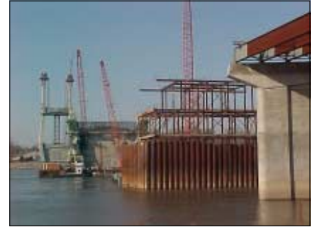
View of the bridge from the Illinois approach spans.

then establish communication with the CRS to stream data out using standard internet communication protocols. Overall, once deployed, the instrumentation scheme will provide extensive strong-motion response recording capability to facilitate different types of studies and to assess the performance of the bridge during strong-motion events.