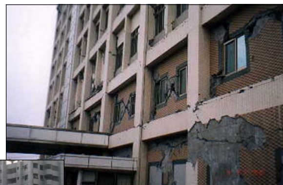
The Shiu-Tuan Hospital, the largest in Nantou County, was forced to close following the earthquake due to extensive damage.