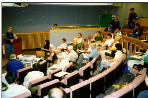
Workshop attendees listened to Kobe's experience with short-term restoration strategies.