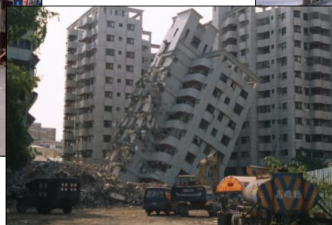
Newly constructed buildings suffered severe damage.