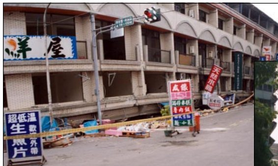
There were many examples of building failures due to soft first stories.