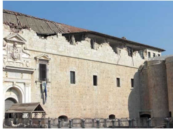
Fig. 3 Front view of the Fortezza Spagnola after the earthquake; central part (left) and right part (right). The upper part of the wall has failed at several locations. More severe damage is observed at the centre, above the main entrance, where the upper end of the wall, supporting the roof, has collapsed. As a result, the roof has sustained significant damage as well