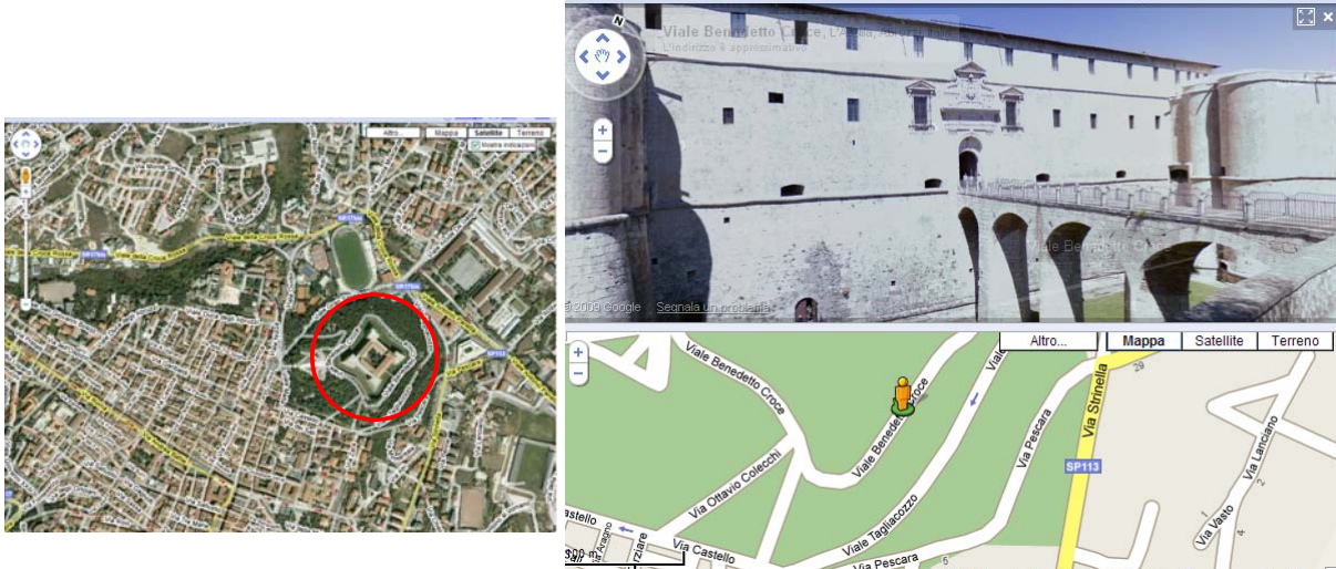
Fig. 1 Location of the Spanish Fort

Description: Fortezza Spagnola (Spanish Fort) is a medieval castle made of masonry and was erected in 1534 by the Spanish viceroy Don Pedro de Toledo. It is currently hosting the National Museum of Abruzzo. Damage was observed at the front side of the castle, where the highest part of the wall, connected with the inclined roof, collapsed in the direction perpendicular to the wall plane.