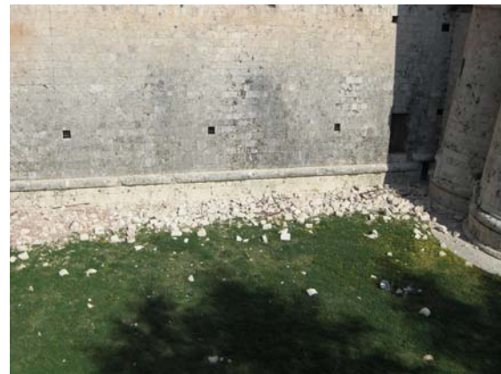
Fig. 5 Fallen rocks in the ditch surrounding the fort on the left side of the entrance (left) and on the right side of the entrance (right)