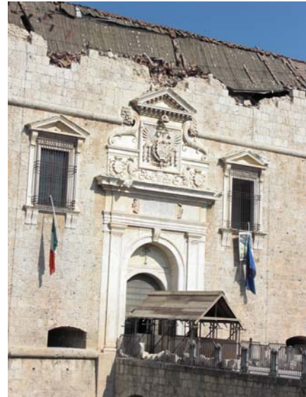
Fig. 4 Close-up views of the central part of the front side of Fortezza Spagnola