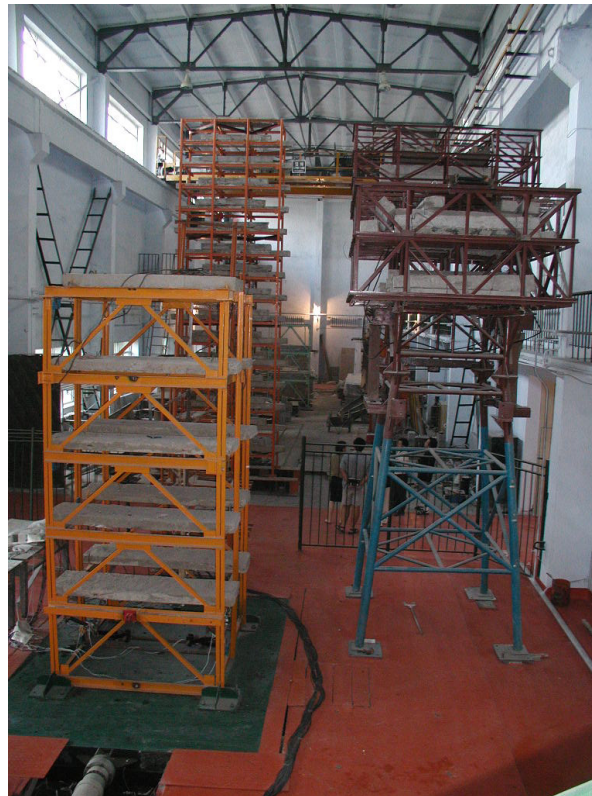
Shaking Table and part of tested structural models

The SEPM houses a uniaxial shaking table sized 4m×3m that was produced by Siemens Corporation and built in 1986. The shaking table consists of a hydraulic actuator/servo valve assembly and a hydraulic power supply that drive a slip table. The capabilities of the shaking table are: maximum displacement ±12.5 cm and maximum acceleration ±1 g's with a 15,000kg test load. The nominal operational frequency range of the simulator is 0.1-45 Hz. This facility has a variety of high quality sensors / actuators and a complete computer control / data acquisition system. The intent of having such a facility is to experimentally verify response reduction strategies developed at Harbin Institute of Technology.