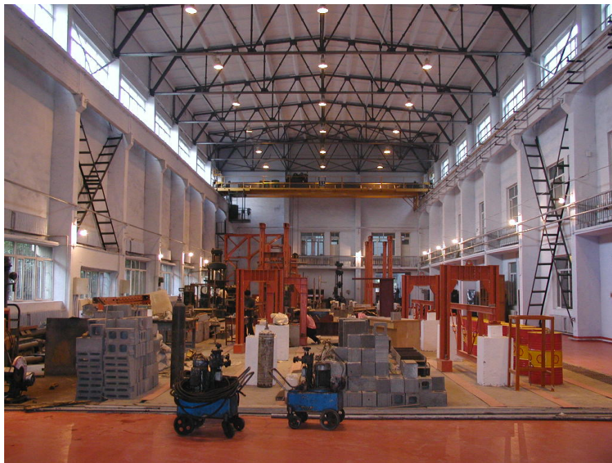
One of Testing Halls

MTS 2500 kN Construction Materials Test System is used for static test, dynamic test and fatigue test. Nominal dynamic load rating that the Construction Materials Test System can provide is +/- 2500 kN with 150% static overload capacity. The test space is width 762 mm (30 in.), depth 508 mm (20 in.), height 400 mm to 3000 mm. Overall frame height is Approximately 4500 mm. The Load frame stiffness is 40E8 N/m. The travel of Integral 2500 kN Fatigue Rated Actuator is 300 mm (12 in) total. MTS's TestStar II is a direct digital test control system for material and component testing. TestStar II Base Controller can provide digital servo control, function generation, data acquisition, and hydraulic control. TestStar II System Software provides a software interface for configuring the controller and the user interface to the test station. The user can enter and save user preferences (units, valve adjustments, loop tuning) for recall at any time.